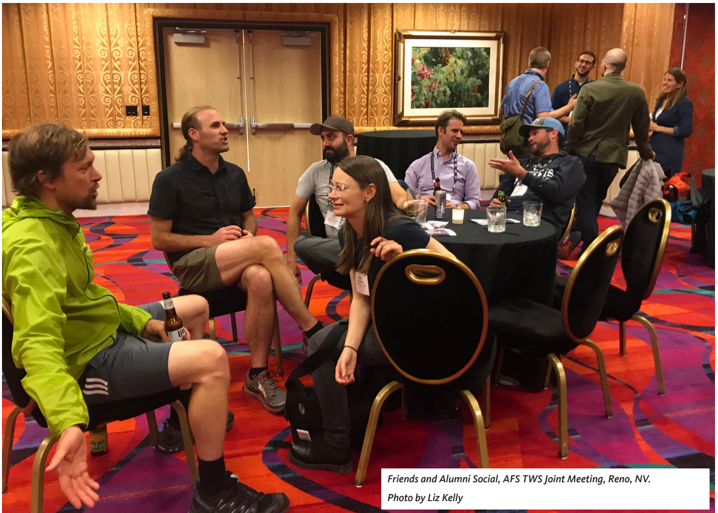
Friends and Alumni Social, AFS TWS Joint Meeting, Reno, NV.