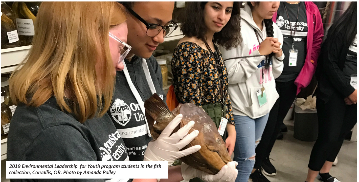
2019 Environmental Leadership for Youth program students in the fish collection, Corvallis, OR.

Our new annual course Systematics and Taxonomy of Larval Fishes (FW 528), and laboratory Larval Fish Identification (FW 529) are unique in the US. FW 529 is taught as a student course and workshop for professional consultants. Participants of the 2018 and 2019 workshops were students, consultants, and NOAA employees from the entire west coast. In 2019 we hosted close to 30 outreach events, reaching from touring the collections with two people to outreach events for schools, the Calapooia Watershed council, and the Oregon Coast Aquarium to name a few.